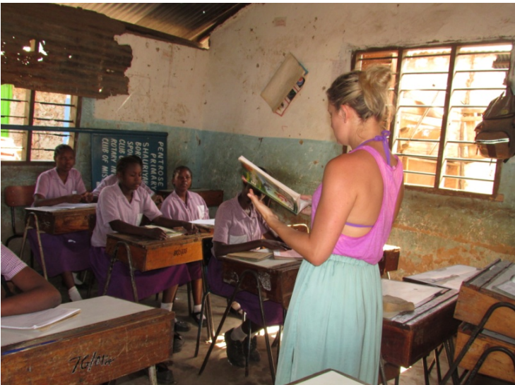
Teaching sessions by Medical Students from Poznan University of Medical Sciences, Poland at Pentrose Community Primary School