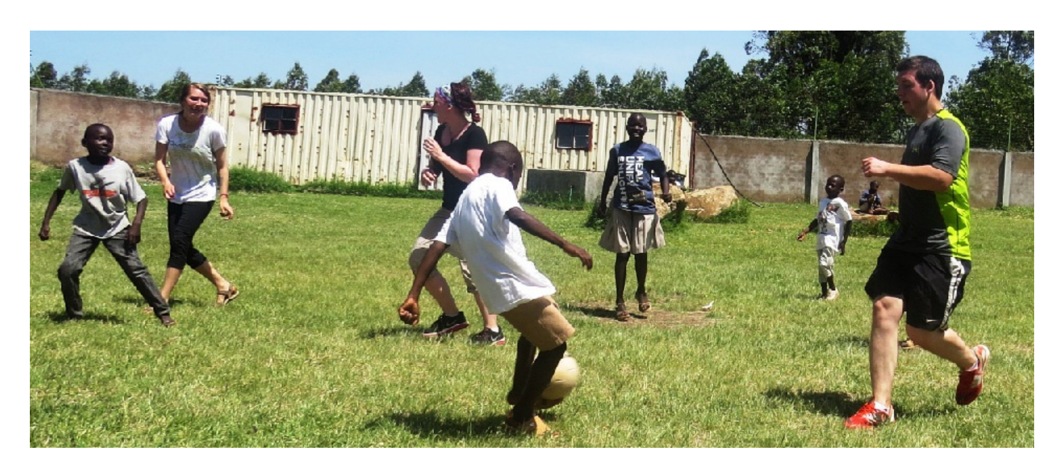
Football Training Session at Brittney Children's Home in Migori, Kenya

For those who can teach, in the mornings you will help to teach classes in your school, mainly English. If you have teaching experience, you can get even more involved. This program gives you the chance to immerse yourself in a rural Kenyan community.