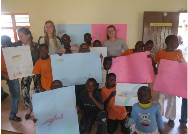
Medical Students from Poznan University of Medical Sciences, Poland shares cheerful Moments with the disadvantaged children & Orphans