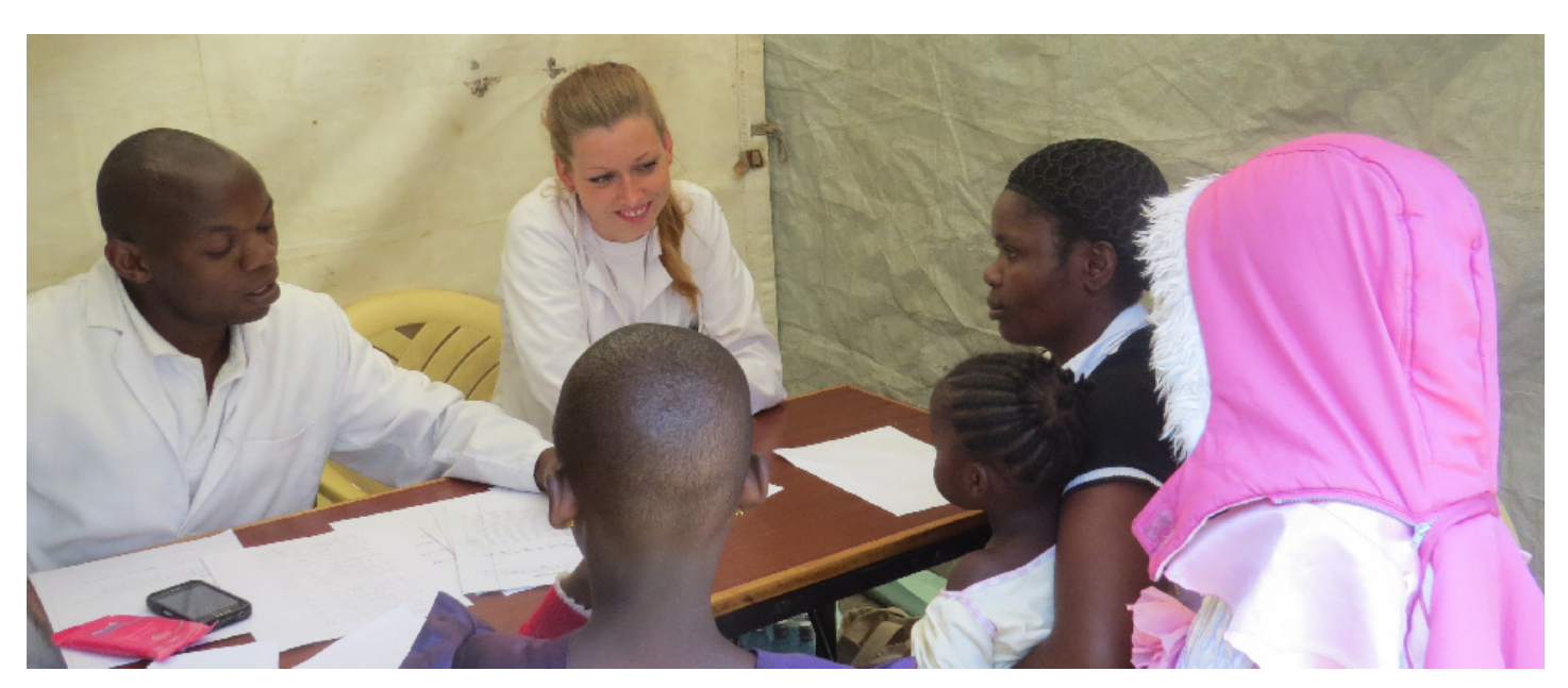
Norway Medical Student from Poznan University Medical Sciences during a Free Medical Camp in Nairobi

Working in community health clinics or mobile clinics, volunteers participate in basic prevention and outreach programs such as treating basic ailments, providing nutritional support, administering de-worming medication and vaccinations to children. Participants are expected to spend time understanding access and delivery of care in the communities they serve, including the role of such like NGOs, faith-based organizations, and traditional healers in community's healthcare needs.