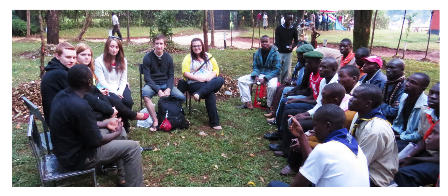
Memorial University of Newfoundland, Premedical Students during Community Outreach Session in Migori, Kenya

Many communities in rural remote areas and distressed urban neighborhoods have limited access to proper sanitation, clean water, healthcare or education. Community development volunteering will involve working with a select community and its leaders to identify areas of most need and assisting as much as Elective Africa volunteers possibly can. Projects may include new or ongoing projects. Through partnered organizations - who are usually the main contributors of the projects -, we link our participants with these organizations to provide a platform where they are able to get involved in the major community development projects in the area. Example of a community project may involve sinking a borehole, installing a water pump, building a water tank, and teaching basic purification methods for drinking water.