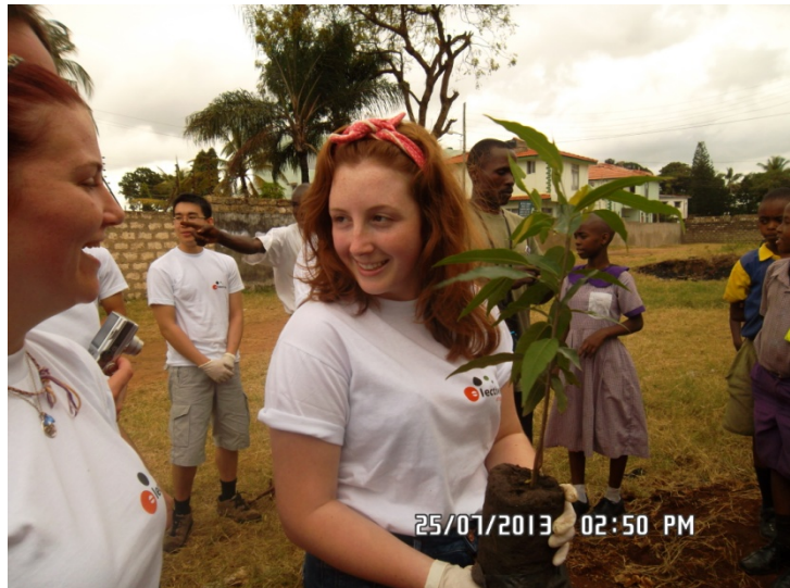
Tree planting at Pentrose Community Primary School in Mombasa, Kenya